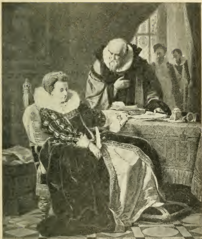
QUEEN ELIZABETH CONFIRMS THE DEATH WARRANT OF MARY STUART.